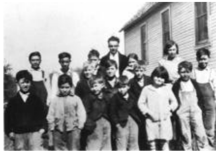
Black Hill School Class, about 1929