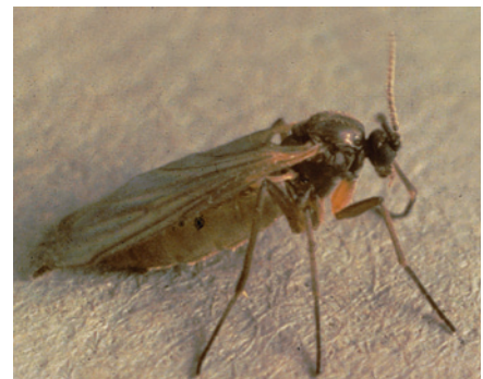
Figure 45.2 —Adult fungus gnat.