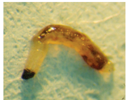
Figure 45.3 —Larva of fungus gnat.