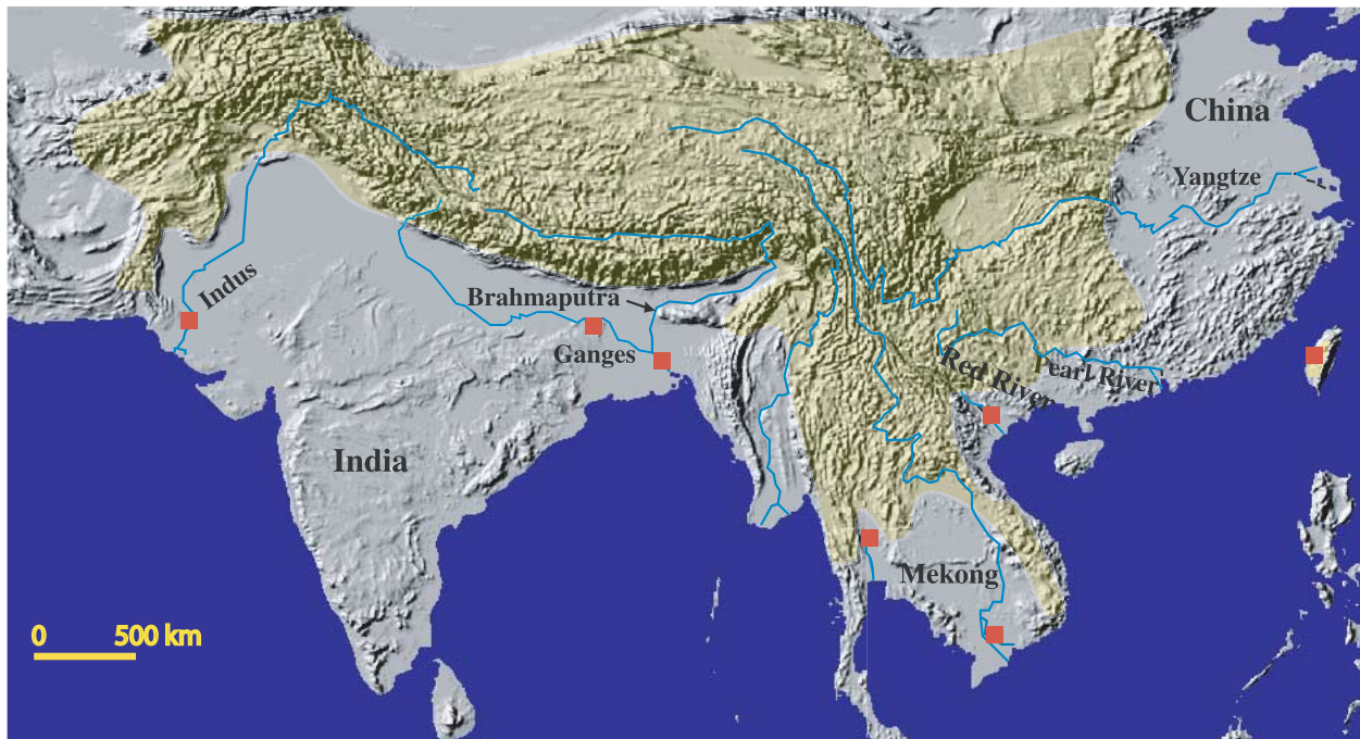
Figure 2. Principal areas (yellow) covered by Pleistocene glacial ice in south Asia. Major occurrences of arsenic (red squares) in Bangladesh, Western Bengal (India), Pakistan, Vietnam, Thailand, and southern China are associated large alluvial or floodplain formed from glacial spillways. Arsenic contamination also occurs along the northern glacial outflow areas (not shown), including Inner Mongolia, Xinjiang, and Shanxi [Nordstrom, 2002].

hypothesis about the connection between tectonic uplift, glaciers, and natural As-contamination of groundwaters. The basic tenet of the hypothesis is that enhanced mechanical weathering of rocks by Pleistocene mountain-building or glaciation led to chemical weathering of the reactive, high-surface area glacial deposits upon Holocene warming. This renewed chemical weathering released As to the hydrosphere, and a series of linked biogeochemical processes have lead to As enrichment in Holocene alluvial aquifers.